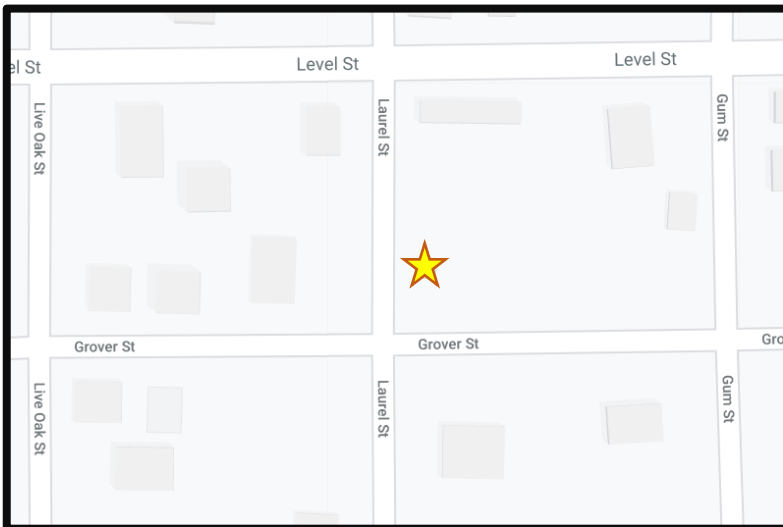
GOOGLE MAP LOCATION