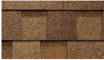
Desert Tan †

See map for colour availability in your area