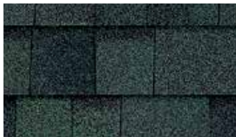
Chateau Green †