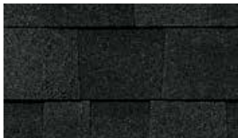
Onyx Black †