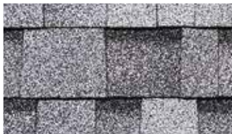
Sierra Gray †