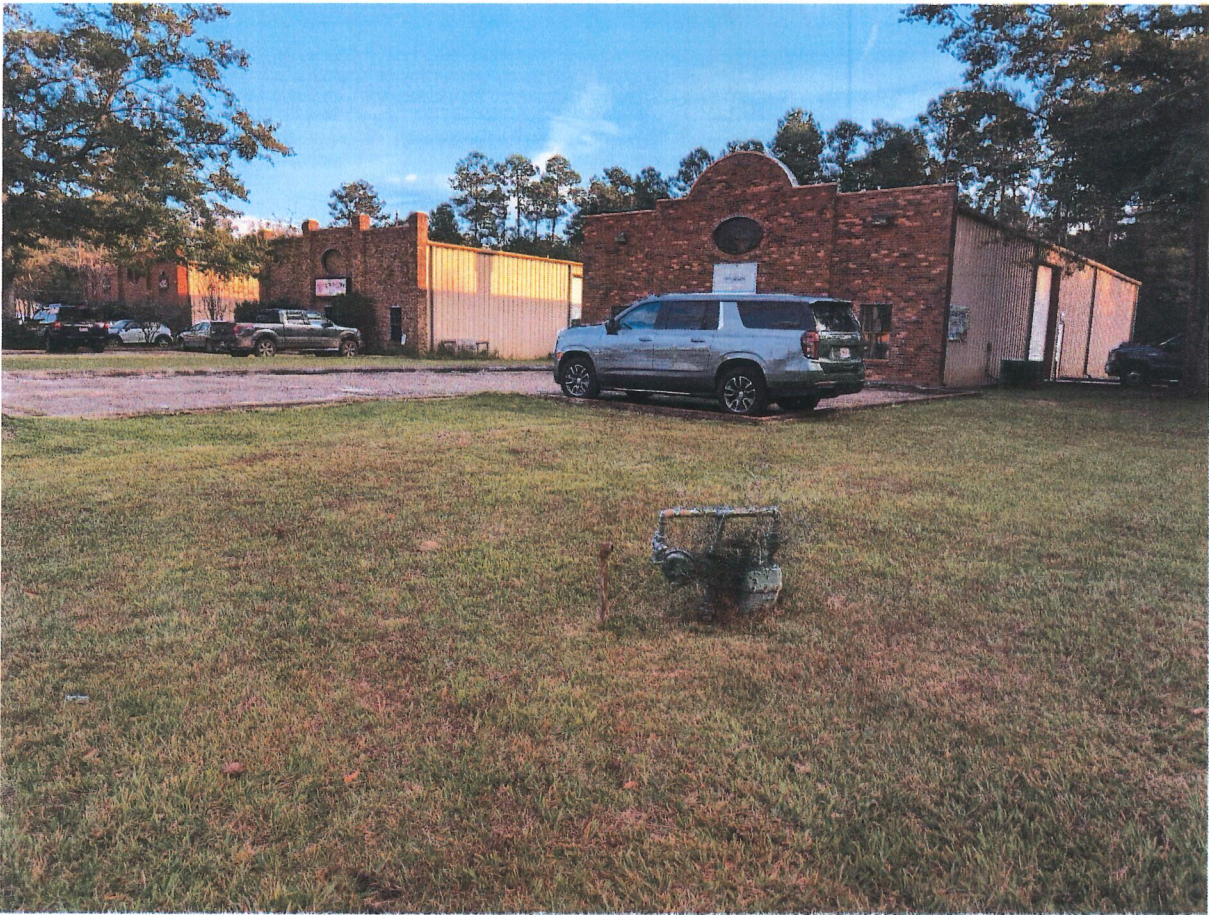
Keep Abita Beautiful sign will be placed at a diagonal facing Highway 36 north Corner of Kustenmacher Road and Highway 36