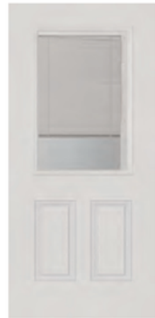
◆■● 684/672-RLB (LowE available)