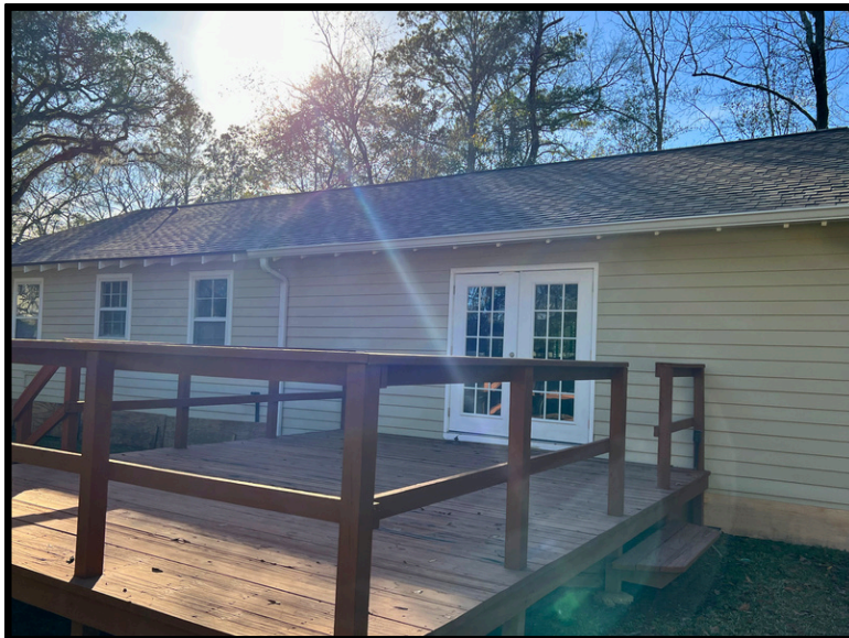
Right Side French Doors