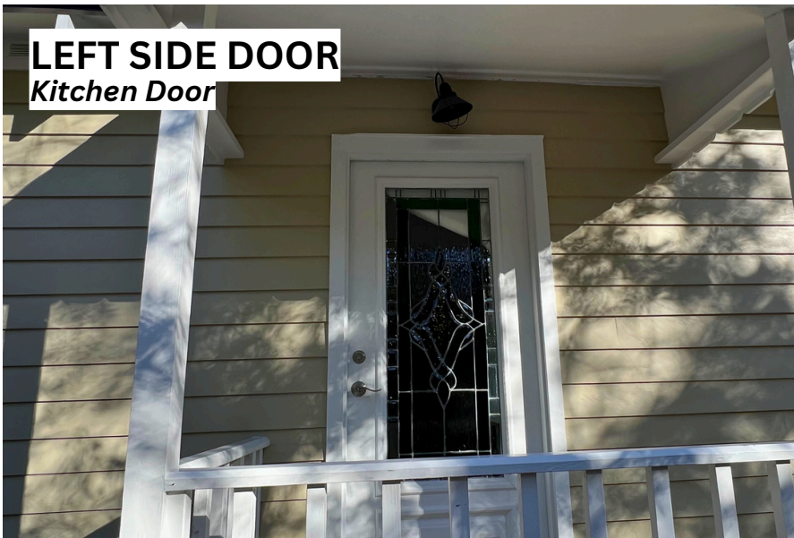
LEFT SIDE DOOR Kitchen Door