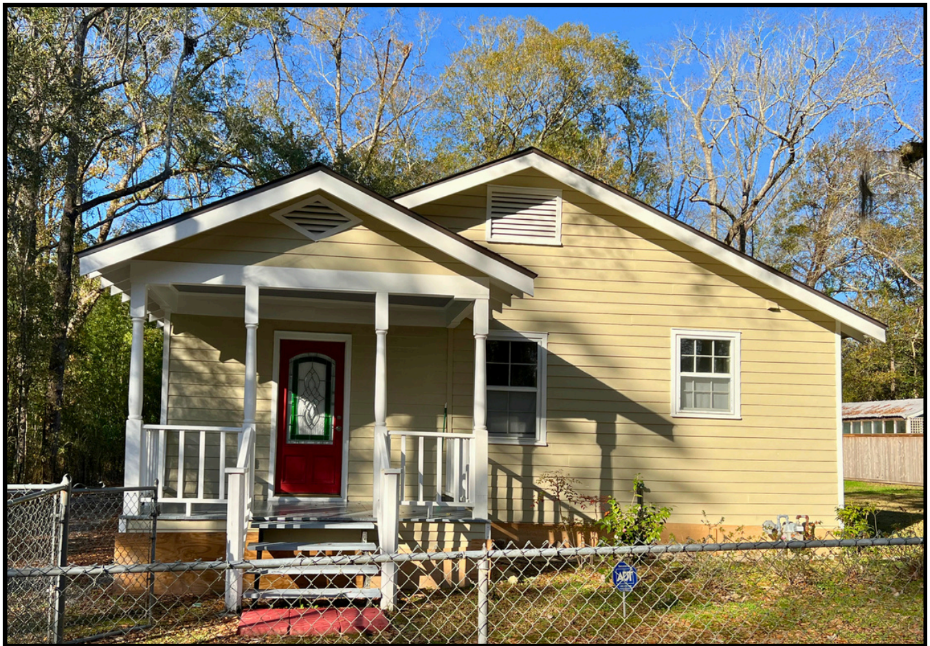
22227 Main Street, Abita Springs, LA 70420