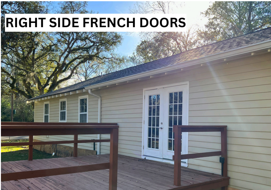
RIGHT SIDE FRENCH DOORS