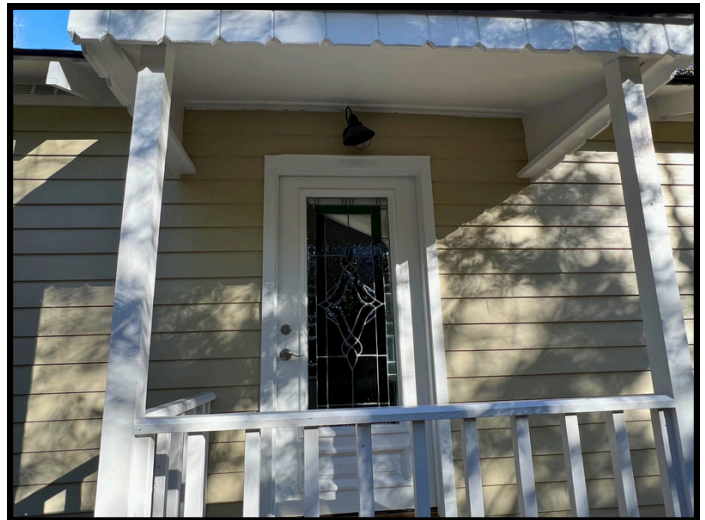
Left Side Door