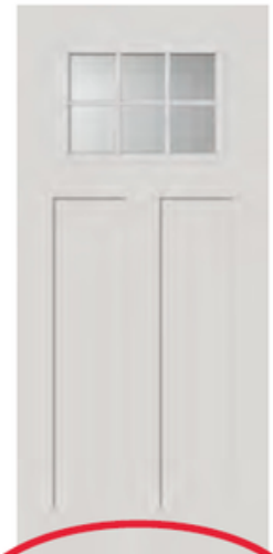
◆●▲ Craftsman door 868-CLSD • 6-lite