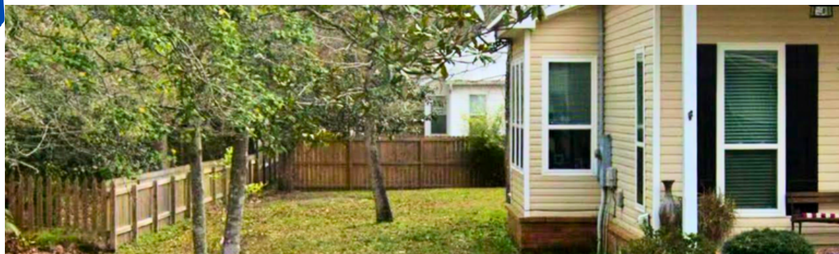
Existing 4' Picket Fence